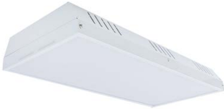
LOW BAY - FROSTED LENS 50 WATT