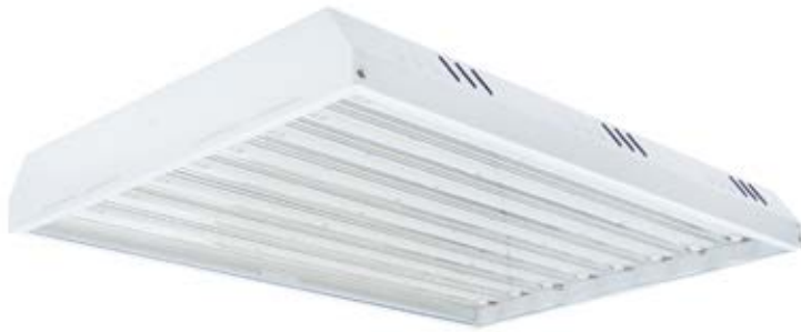
HIGH BAY - CLEAR LENS 100 & 150 WATT