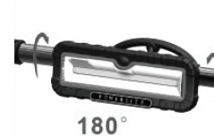
Rotates 180-degrees (Vertically)