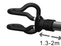
Extendable mounting Bracket between 51"-75"