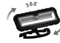
Rotates 360-degrees (Horizontally)